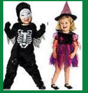
When the holiday ends, be sure to donate what you don't wish to keep and recycle homemade items, such as stars made from aluminum foil or wands made from holiday wrap tubes. Whenever discarding any textile item from shoes to drapes,

A cape can be made from an old blanket, fancy towel or folded sheet. Be creative if you can and if you can't choose your new items wisely.